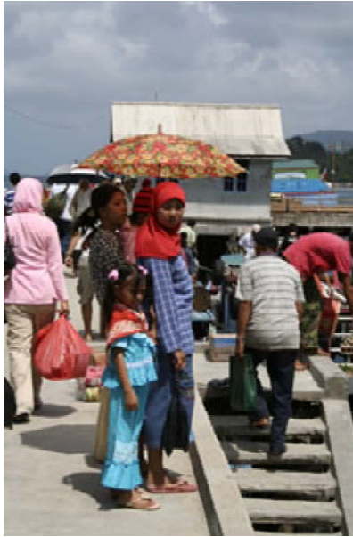
there are no cars, only boats and a couple of motorcycles