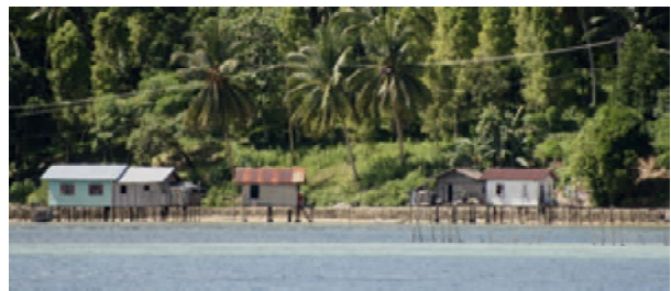
their guest house in Tebu; most houses we saw in the Anambas Islands are built on stilts over the sea