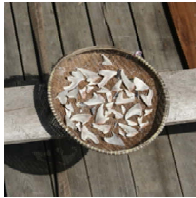
clams cut up ; shark fins drying on the roof of a fishing boat