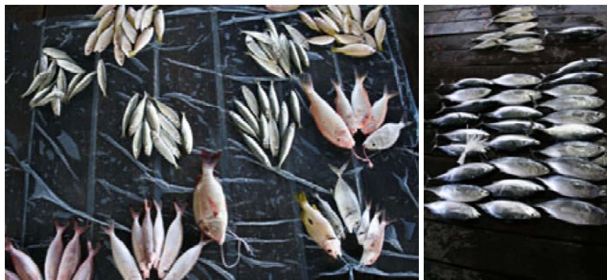
reef fish and tuna at the fish market which starts at 5am