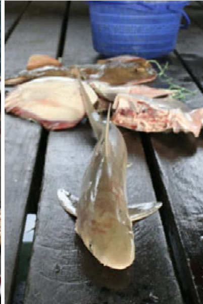
guitar fish, shark fins and a very small juvenile shark