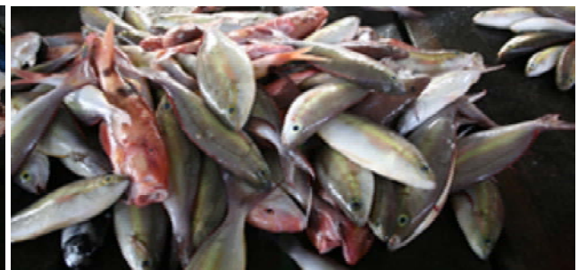
stingray and small reef fish