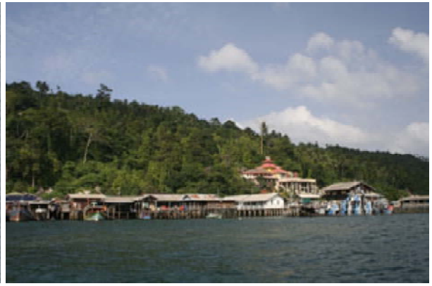
SV Infinity approaches Siantan, passing Terempah before anchoring in Tebu