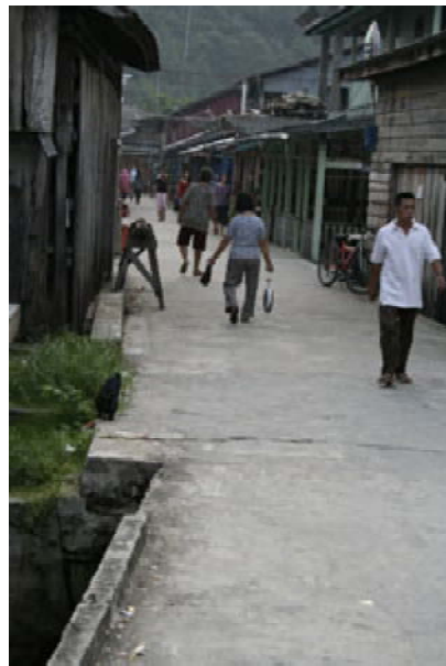
everyone in town comes to buy their catch early in the morning, the market closing for the day around 7am