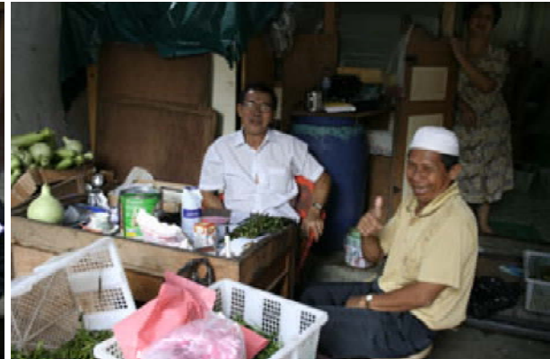
street scenes in Terempah