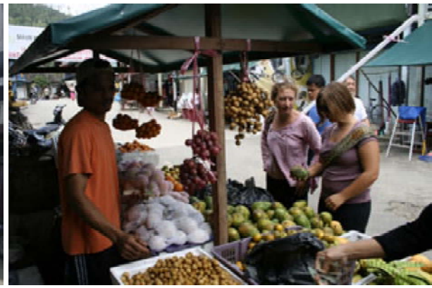
scenes from the fresh food market