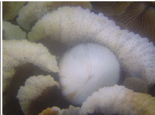
crown of thorns damage on Montipora spp. and Fungia spp. colonies on the ridge in Selat Onas